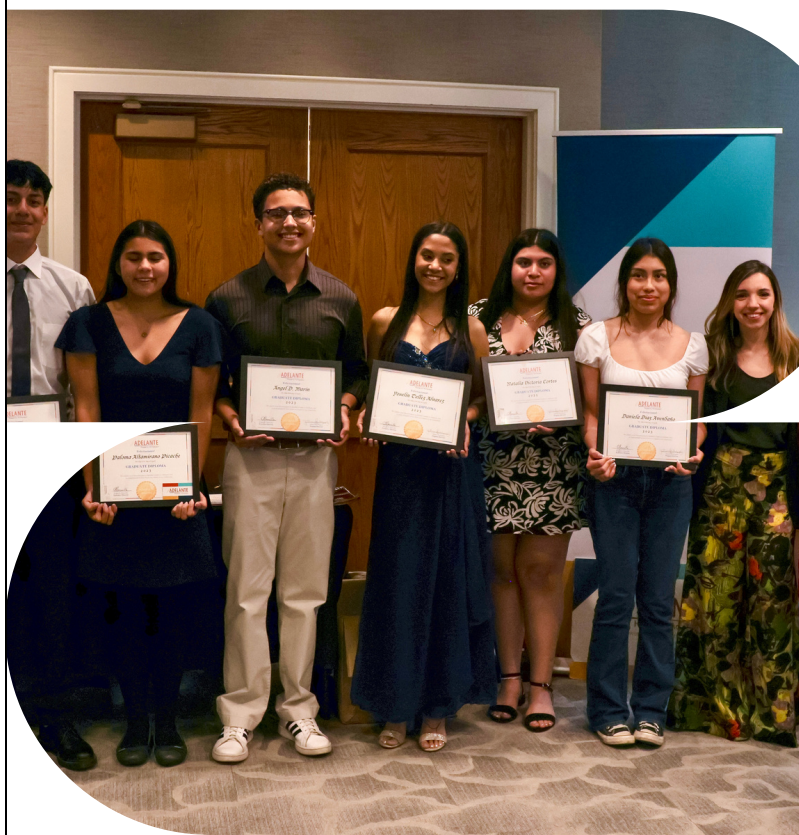
Adelante's graduation ceremony celebrated 10 Adelante seniors. Six seniors were granted scholarships through Adelante's College Allies ensuring their path to post-secondary education.

Our approach combines various elements, such as developing study skills, ACT preparation, providing shadowing opportunities, organizing college visits, offering resume-writing assistance, and delivering one-on-one college-application coaching. This comprehensive approach has yielded significant success, with twelve cohorts graduating thus far. Adelante Achievers are now attending or have graduated from universities and colleges, often with scholarships, marking a significant milestone in their educational journey.